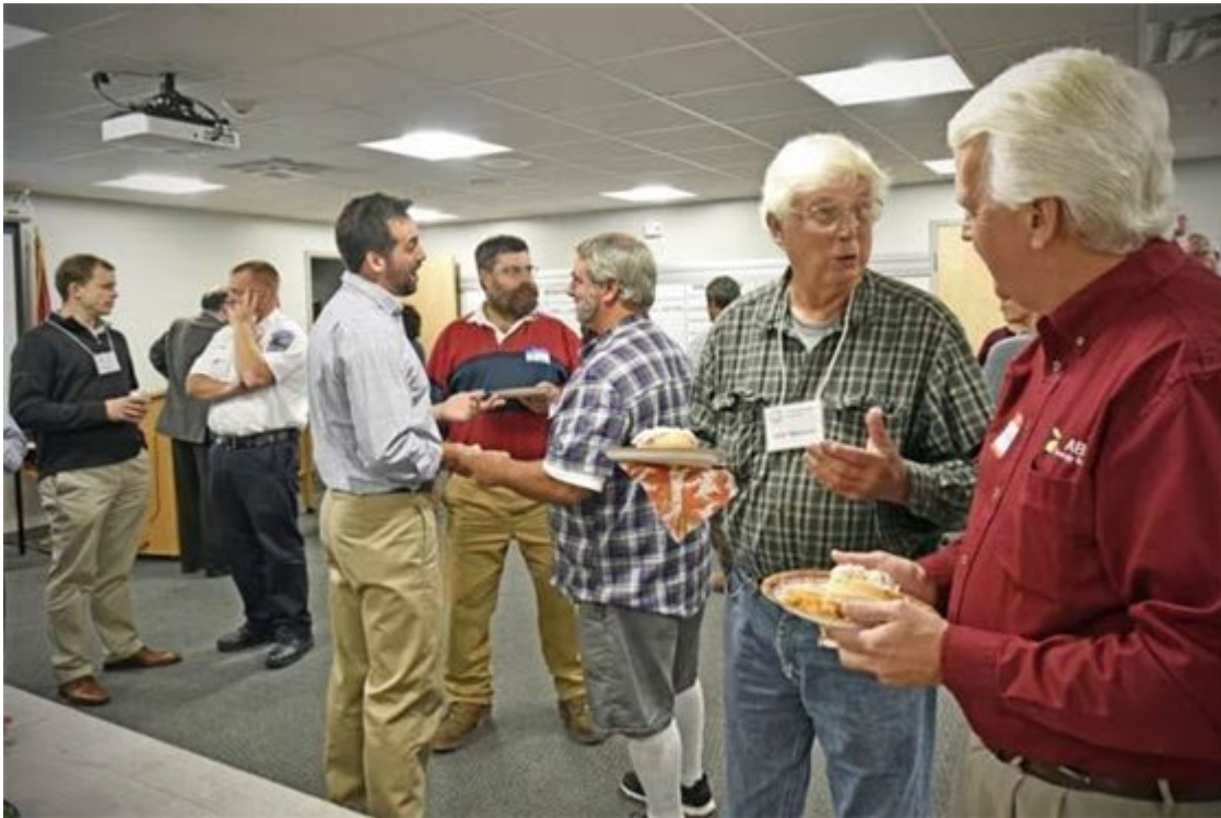
The Business Development Commission recently met at the Bow Safety Center.

Bow Safety Center. Owners or representatives from over 30 local businesses were in attendance along with representatives from the Greater Concord Chamber of Commerce. The event also included a guided tour of the facility.