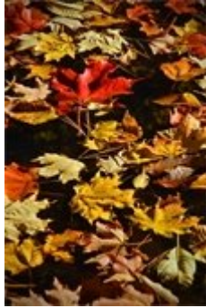
Autumn leaves floating on pond.