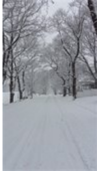
A New England Snow Covered Road