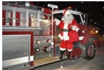
Here comes Santa