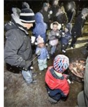
Let's make S'mores