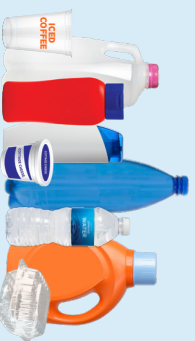
Plastic Bottles, Jugs, Tubs, & Lids (Empty kitchen, laundry, & bath containers & clamshells)