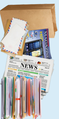
Junk Mail, Periodicals, & Office Paper (Paper bags, envelopes, & catalogs)