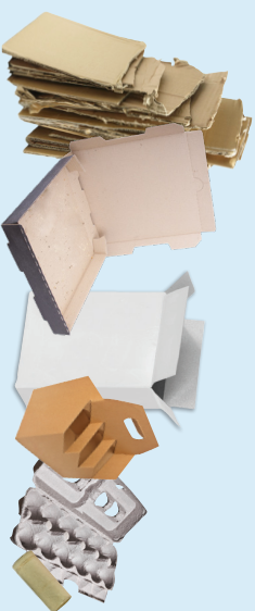
Cardboard & Boxboard (Clean & dry)