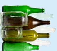
Glass Bottles & Jars (Empty food & beverage bottles & jars)